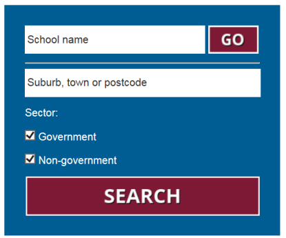
Find a school

Where it states 'School name', type in the name of the school you wish to view, select the school from the drop-down list and select <GO>. Read and follow the instructions on the next screen; you will be asked to confirm that you are not a robot then by clicking continue, you acknowledge that you have read, accepted and agree to the Terms of Use and Privacy Policy before being given access to the school's profile webpage.